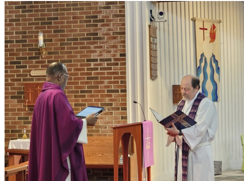
Pastor accepting the call.